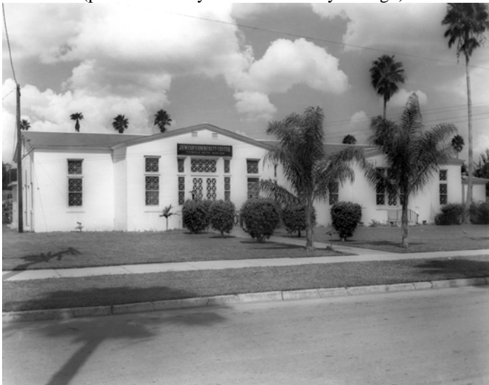
(circa 1956) Temple Beth Sholom at Washington Blvd. and Twelfth Street. (today's Sixth Street) in Sarasota was built in 1928. In 1959, Temple Beth Sholom moved to Tuttle Avenue in Sarasota. Temple Beth Sholom was established in 1927.

(pictured as they looked over 50 years ago)