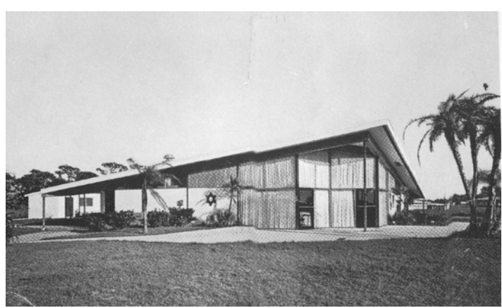
(circa 1962) Temple Emanu-El at 151 McIntosh Road in Sarasota was built in 1960. Temple Emanu-El is still at this location, but has been remodeled. Temple Emanu-El was established in 1956.